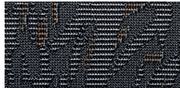
DX - Woven fabric interior seat trim

If the loaded vehicle mass is reduced as shown in the table, the towball download can be increased correspondingly. Accordingly, if the laden mass is 115kg less than the GVM † a towball download of 150kg is approved. Different trailer types and different trailer manufacturers have varying towball downloads. The customer will need to contact the trailer manufacturer for information as to the download. Nissan does not recommend the fitting of load levelling or weight distribution devices when used with a Nissan Genuine towbar. When fitted and used correctly, the Nissan Genuine towbar is capable of meeting the towbar/towball capacity stated in the above table.